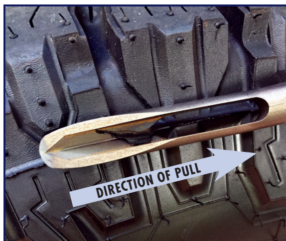
Close-up of flash trim tool removing flash from tire (tool shown without V-shaped cutting edge)